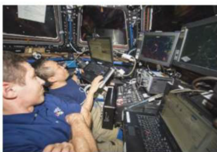
NASA JOHNSON SPACE CENTER

"We're trying to commercialize the station and inspire the nation by using a minimum of 50 percent of upmass and downmass and astronaut time for the benefit of mankind here on Earth,"